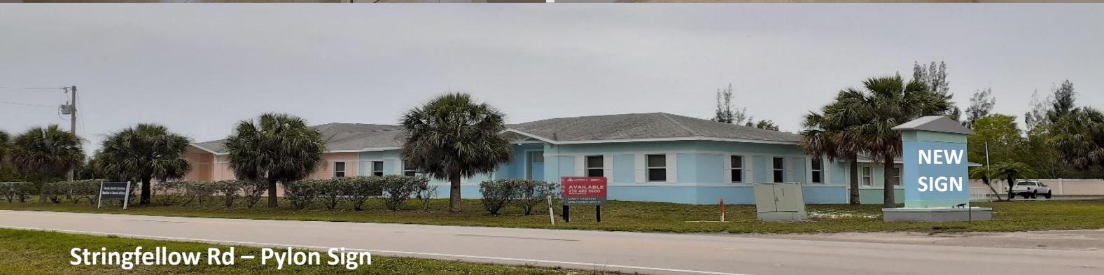
Stringfellow Rd – Pylon Sign