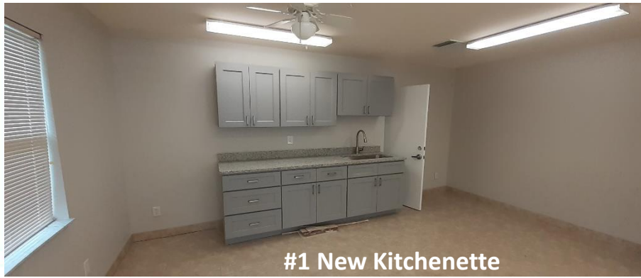
#1 New Kitchenette