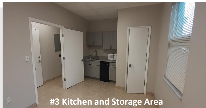
#3 Kitchen and Storage Area