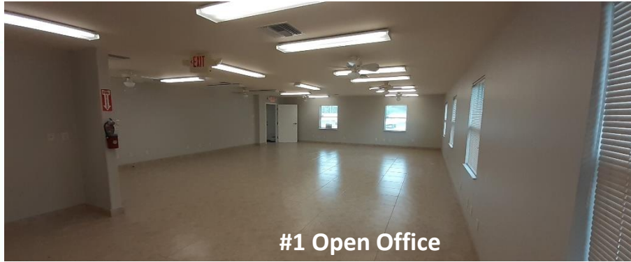
#1 Open Office